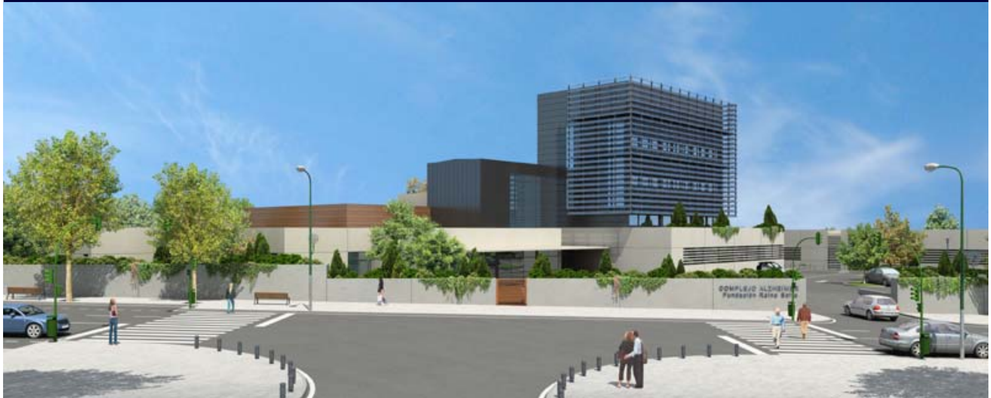
The Queen Sofía Foundation's Alzheimer's Disease Project